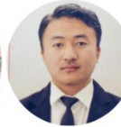
PETELAVI LIEZIETSU SOCIOLOGY CGPA 8.63